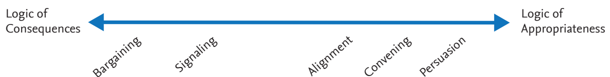
Figure 2: Non-Hierarchical Modes of Governance.

In the following, we will first elaborate upon and describe the five modes of governance we identified when analyzing IO governance in areas of limited statehood, drawing both on interviews conducted with IO staff as well as on organizational documents. We begin with those governance modes, which are located at the left side of the spectrum and thus closer to a logic of consequences, namely bargaining and signaling . Then, we proceed to modes that increasingly follow a logic of appropriateness, namely alignment , convening , and persuasion .