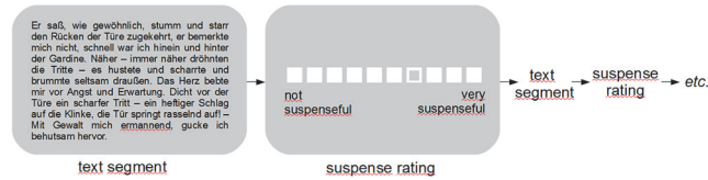
Fig 1. One trial of the experiment: a segment of the text was presented, followed by a rating screen on which the suspense experienced while reading the text segment was selected on a 10-point scale using two buttons (for moving the selected point on the rating scale to the left or right). Timing was self-paced, i.e., participants pressed a button in order to proceed to the next text segment / rating screen. A total of 65 text segments was presented during the experiment.