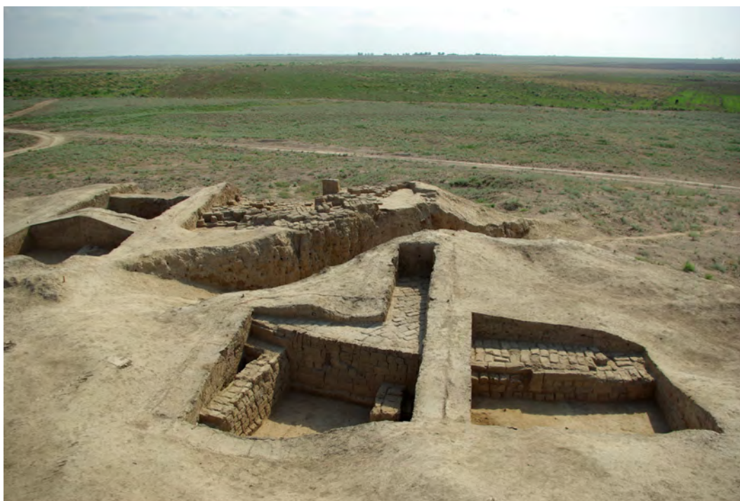
Fig. 2 | The massive mud brick platform of Kamiltepe, (copyright: DAI).

building a massive sub-circular platform (Fig. 2). 10 Unfortunately, the upper part of this mud brick construction no longer existed prior to the beginning of excavation in 2009 but, on the basis of the micromorphological analysis of thin sections, it can be assumed that one or more built structures made of mud and vegetal materials had been erected on top of it. 11 Located in the rather flat landscape of the lower Kara Çay Valley, Kamiltepe was a monumental landmark visible from a distance. For multi-sited, highly mobile groups with loose physical borders, Kamiltepe might have acted as an anchoring place to which the 6th millennium BCE communities felt attached and where they gathered to perform communal rituals. The latter might have also included commensal events or ‘feasting,’ 12 as suggested by large quantities of bones of domesticated and wild animals recovered in several dumping ashy layers around the platform. 13 The variety of ceramic vessels used for eating and drinking 14 as well as the botanical remains 15 and use-wear analysis on stone tools 16 found in these contexts also provide evidence for intense and varied activities of food preparation and cooking directly linked to practices of food consumption. These forms of recurrent community social anchoring practices might have tightened up relations among dispersed but integrated small social groups. 17