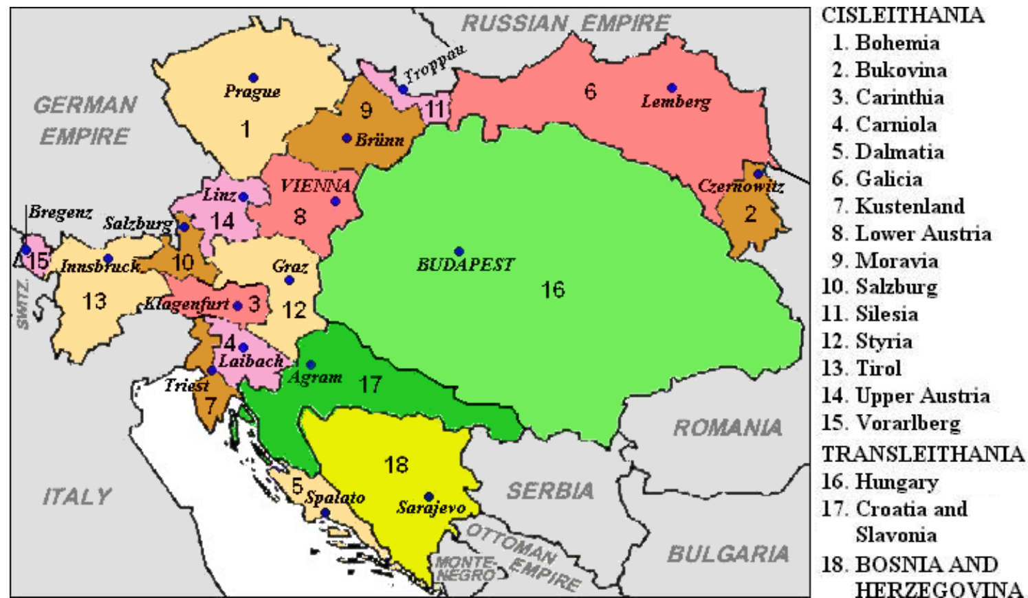
Map1: the provinces and province-capitals of the Habsburg Empire prior to 1914