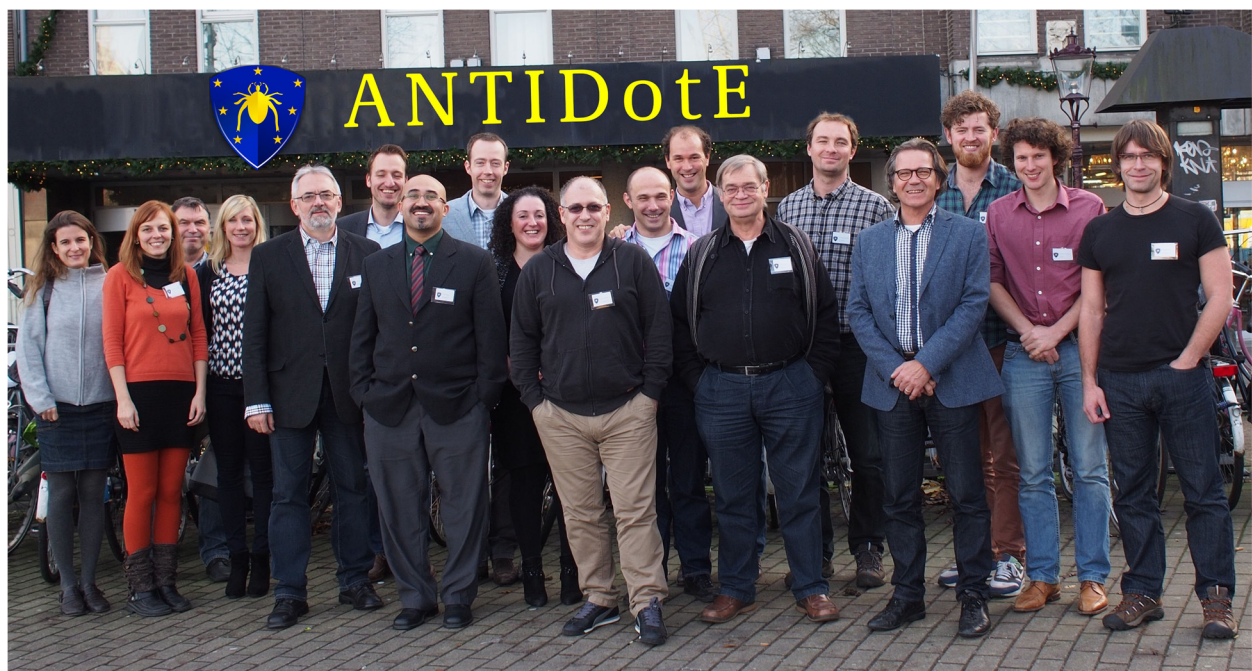
Figure 1 The participants of the official launch meeting of ANTIDotE. This meeting was held in Amsterdam, The Netherlands, in December 2013.