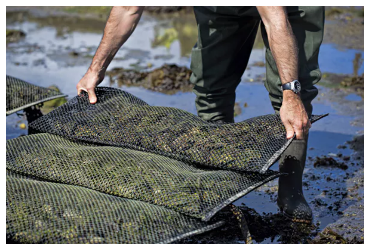
An acidic seawater environment can produce thinner shells in oysters that can be more easily damaged in transit.

I have previously reported on the effect of experimentally induced high CO2 acidification on mussels, where shells showed reduced growth and became more brittle. Shellfish are predicted to produce thinner shells which may also be more prone to fracture throughout harvesting, transportation or when another animal attempts to eat them.