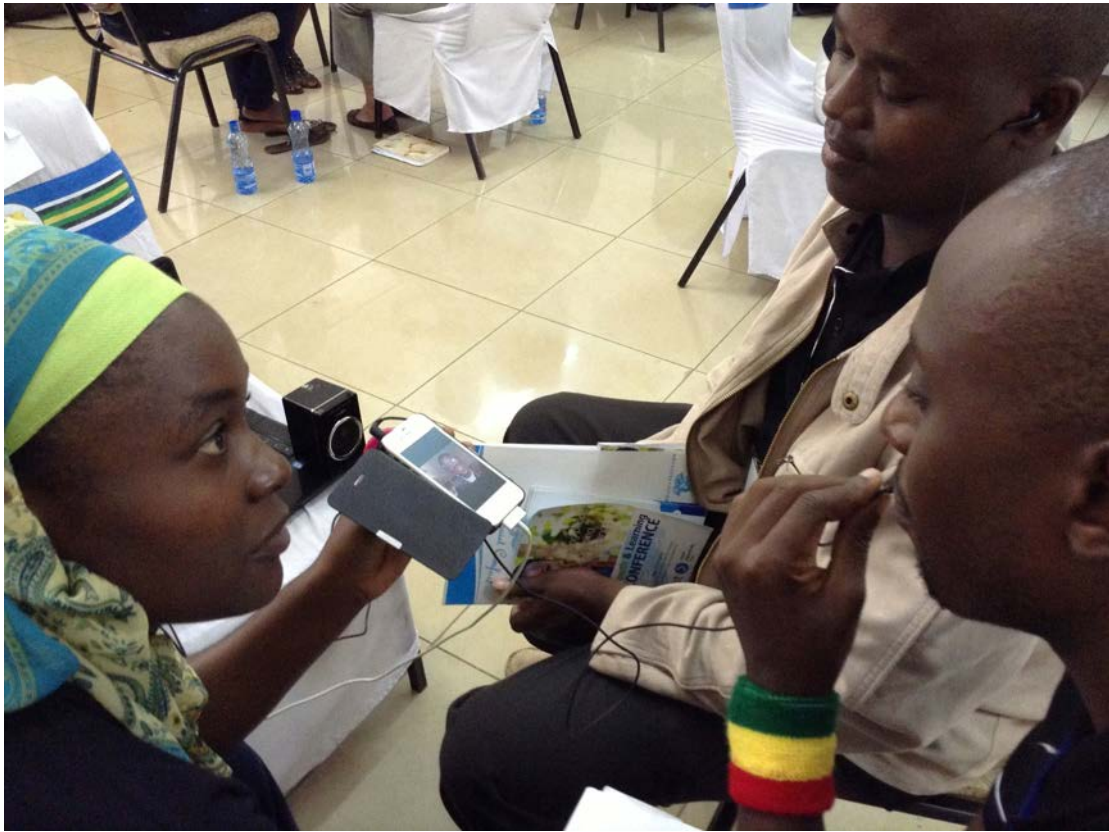
Figure 3. Speed geeking session

In sessions where scholars were participating virtually, a social media team member was assigned to manage the onsite technology, connection, and move the on-screen scholar around. The biggest challenge was internet connectivity. When virtual scholars were participating in the session, the wifi network had to go down to free up as much bandwidth as possible. The virtual scholars were most effective in the speed geeking sessions where they were interacting with small groups.