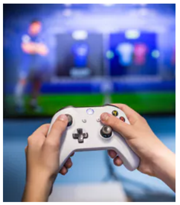
The bum steer.

Equally alarmingly, children's physical fitness has significantly declined since at least the 1980s. They can't run as far without stopping as their parents could.