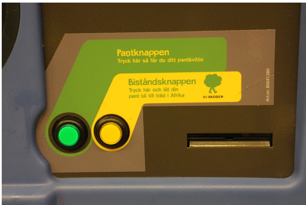
Figure 1. The decision environment: A binary dictator game with heterogeneous endowment

Note: “Pantknappen” on the left is the “Return deposit” button. The instruction translates as “press here to receive your deposit receipt.” “Biståndsknappen” on the right is the “Donate” button. The instruction translates as “press here and let your deposit become trees in Africa.”