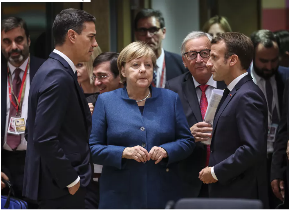
Let the real negotiations begin.