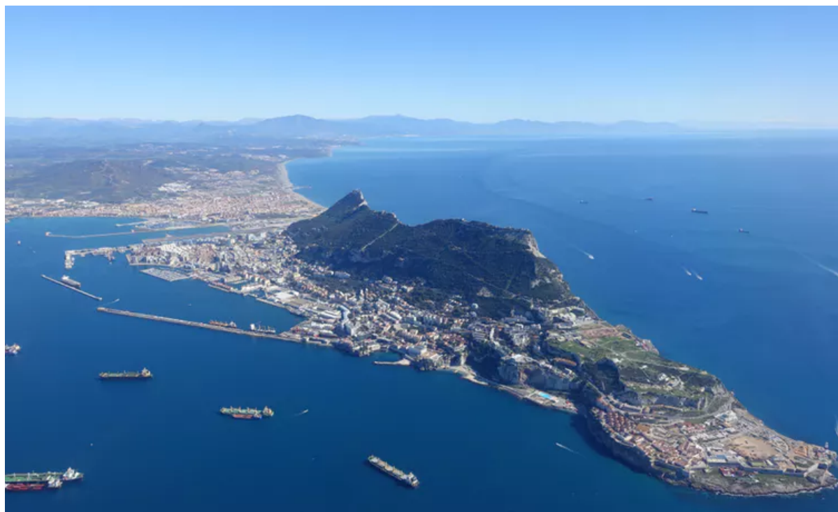
Rocky territory for negotiators.