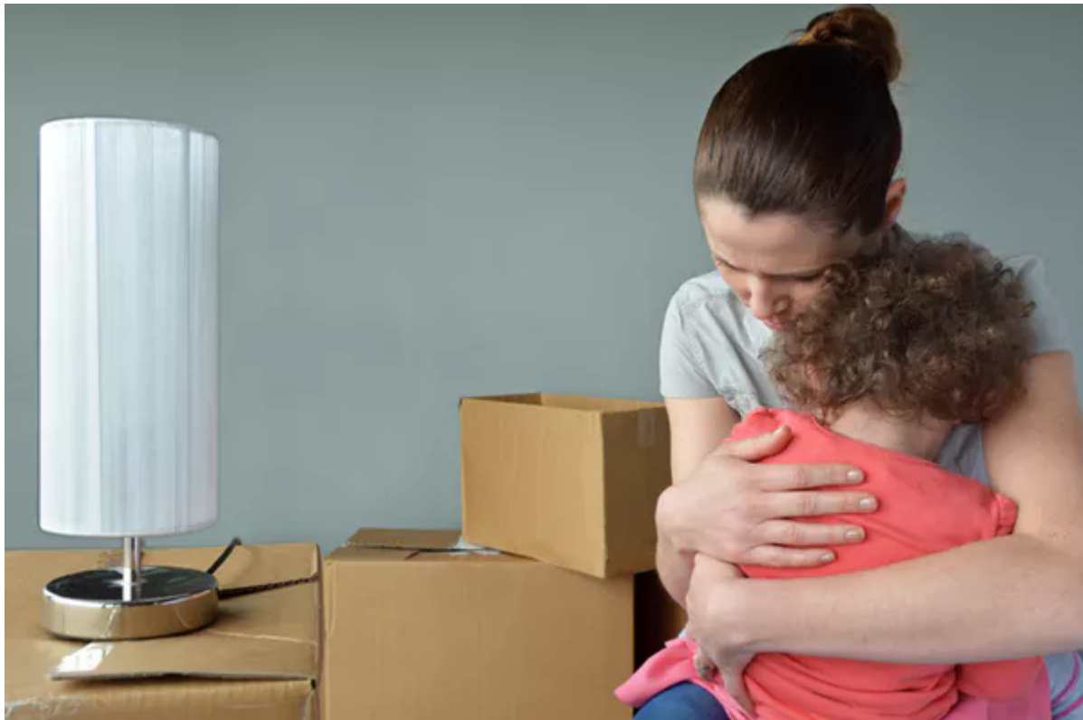
A difficult move.

It's clear that highlighting the tensions between millennials and baby boomers will do little to address these issues: in fact, there is much support and solidarity between the generations. Young people were clear about who they blamed for the current situation: not their parents, but government, and its inability to address the housing crisis and provide the affordable housing they needed.