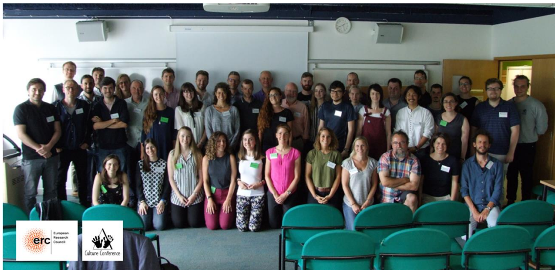
Fig 1: The attendees of the Culture Conference 2018: “Complexity in Culture”.