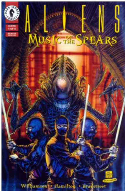
Aliens: Music of the Spears . Dark Horse Comics