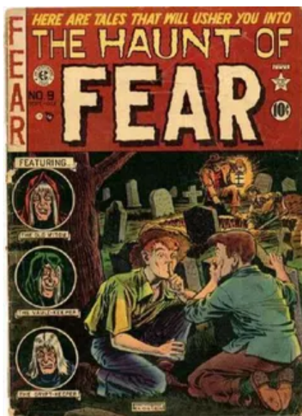
The Haunt of Fear. Entertaining Comics

Comic books of the 1950s and 1960s made a point of their potential to terrify, with anthologies from Entertaining Comics, such as Haunt of Fear, Vault of Horror, and Tales of the Crypt, boasting covers with straplines such as “Within these pages dwell creatures from the terrifying beyond!”