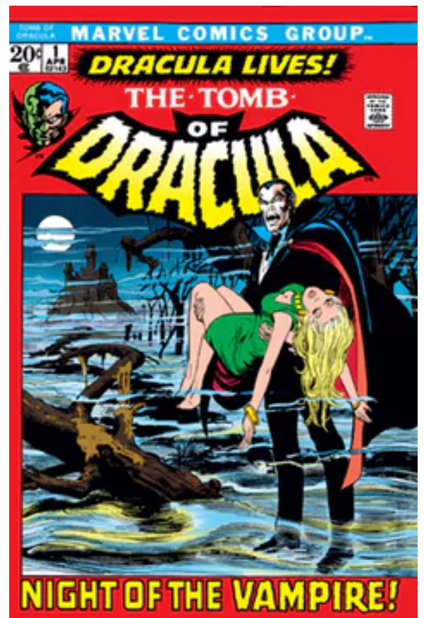
The Tomb of Dracula. Marvel Comics

of a larger Hellboy story arc, The Corpse is also a standalone piece that is a good representative of the narrative tone and art style of the rest.