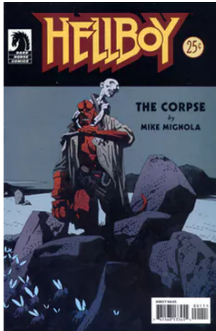
Hellboy: The Corpse. Dark Horse Comics

An excellent example of the Hellboy series, written and drawn by Mike Mignola.