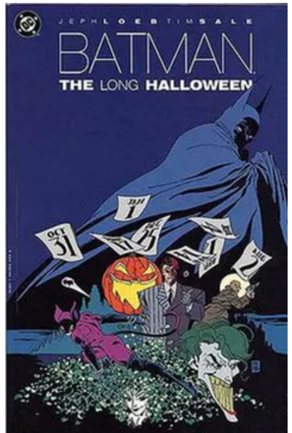
Batman: The Long Halloween . DC Comics

Deadworld exists in a hellish parallel plane to the 22nd-century Earth of 2000 AD’s Judge Dredd series, and The Fall of Deadworld , written by Kek-W (aka Nigel Long), narrates its descent into a