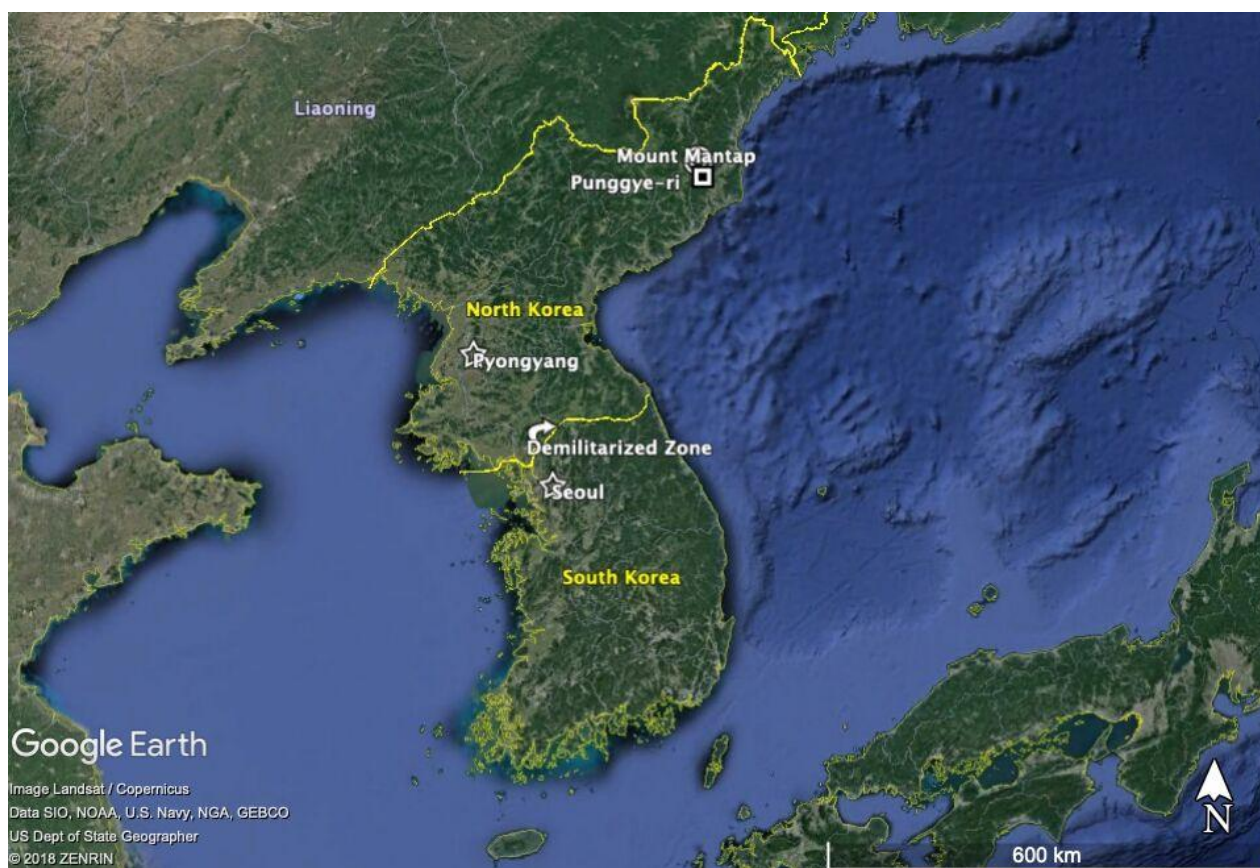
Fig. 1. The Korean Peninsula with Mount Mantap and the Punggye-ri Nuclear Testing Site identified near the top center. Stars denote the capital cities of both Koreas. The yellow line marked by an arrow in the center of the image marks the Demilitarized Zone.