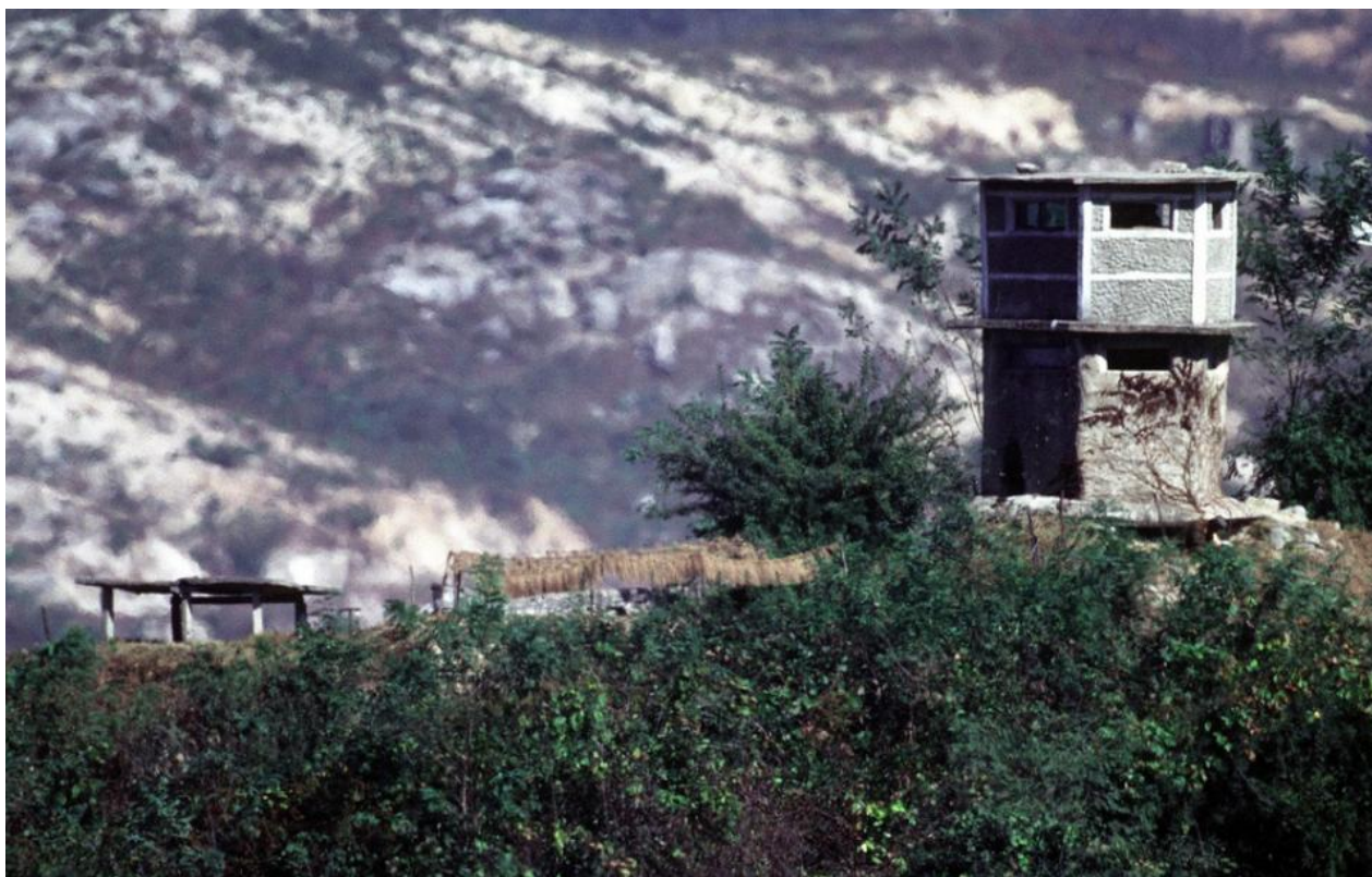
Fig. 6. A North Korean observation post in the Demilitarized Zone.

Photograph by Jeffrey Allen, 20 October 1998.