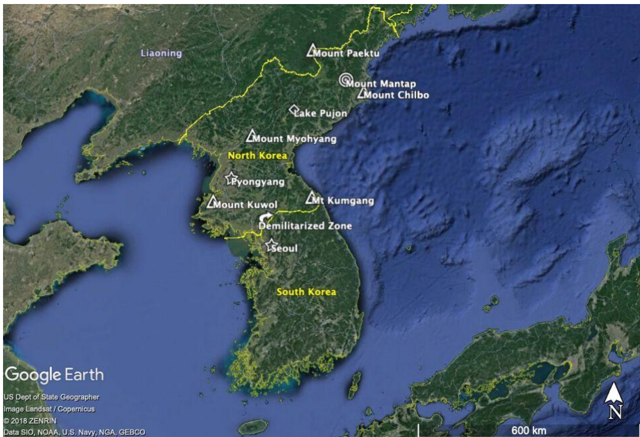
Fig. 5. Map showing locations of North Korea's six national parks (denoted by triangles or squares) and Mount Mantap, the location of the 3 September 2017 nuclear test (near top center). Mount Paektu (top center), a sacred site for many Koreans, sits only 114 km northwest of Mount Mantap.