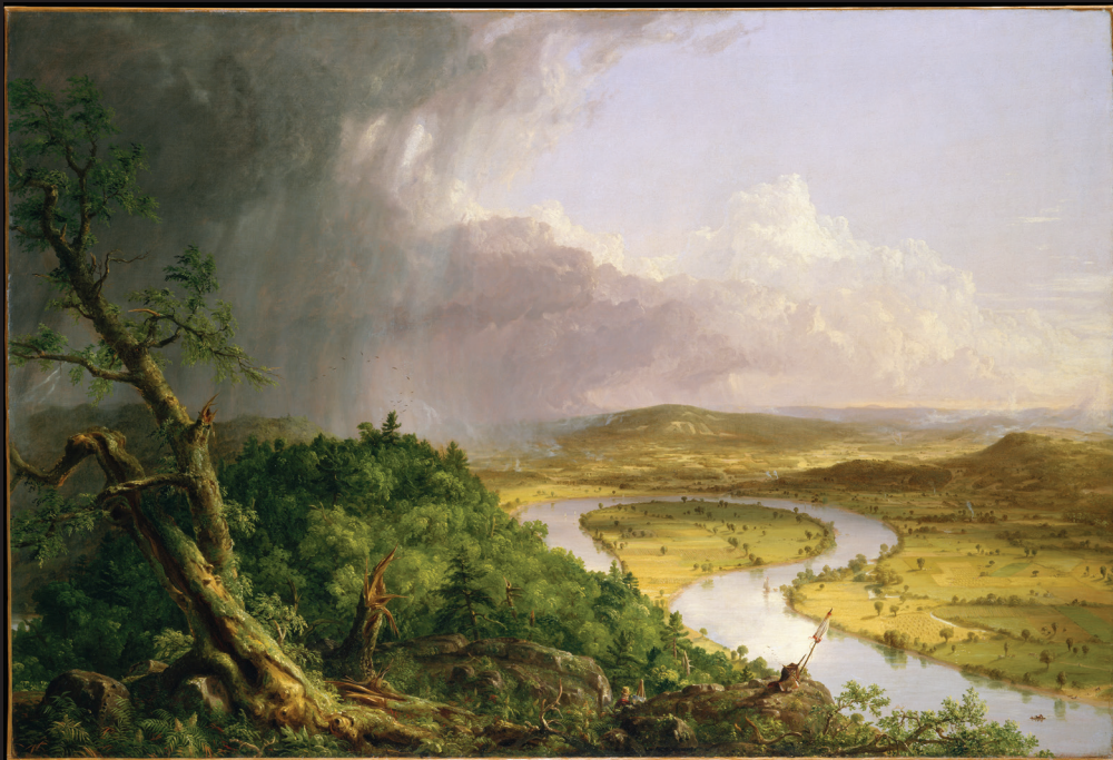
Thomas Cole (1801-1848). View from Mount Holyoke, Northampton, Massachusetts, after a Thunderstorm - The Oxbow. 1836. Oil on canvas, 51 1/2 x 76 in. (130.8 x 193 cm). Gift of Mrs. Russell Sage, 1908 (08.228). The Metropolitan Museum of Art, New York, NY, U.S.A.