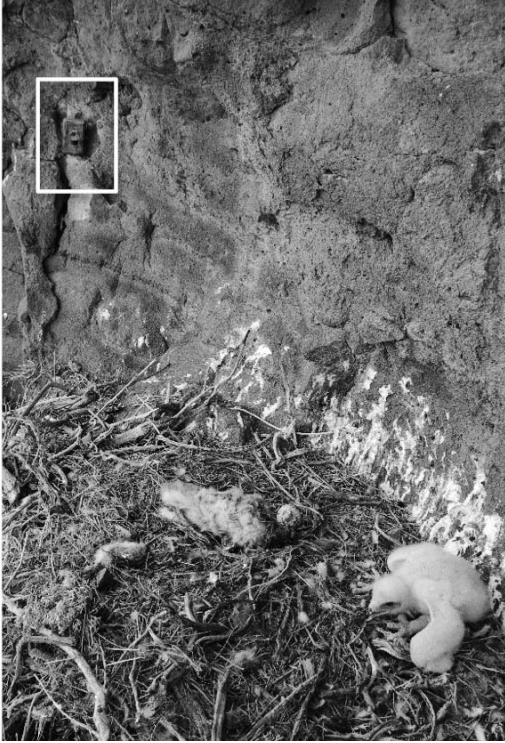
Figure 1. Image of a motion-activated camera installed to monitor Golden Eagle diet and productivity. The camera is concealed in a rocky crevice (left) and is flush against the cliff at a distance of >2 m from the nest (right, camera is highlighted by white box).

was no evidence of adults returning to the nest, we removed the cameras.