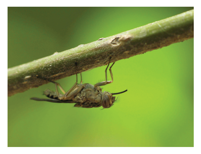
Figure 1. A wild tsetse fly (Glossina palpalis gambiensis) in a protected gallery forest near the "mare aux hippopotames," Burkina Faso.

the biological group of pupiparous insects (Hippoboscidae, Streblidae, Nycteribiidae; Solano et al. 2010). Tsetse flies also have learning capacities (Bouyer et al. 2007), as is evidenced by their preferential return to the first host species they feed on for ulterior blood meals. However, although they are biologically and evolutionarily remarkable, tsetse flies are also specific vectors of diseases with a large detrimental impact on human well-being (box 2). Furthermore, given sufficient political and financial support, tsetse flies can now be eliminated locally and possibly even eradicated worldwide. As a basic rule of ethics, however, can does not imply should. We suggest a full ethical evaluation of tsetse fly elimination is essential to support sound decision-making around the usage of new technologies, to assess whether or under what conditions elimination of an endemic species harmful to humans might be justified.