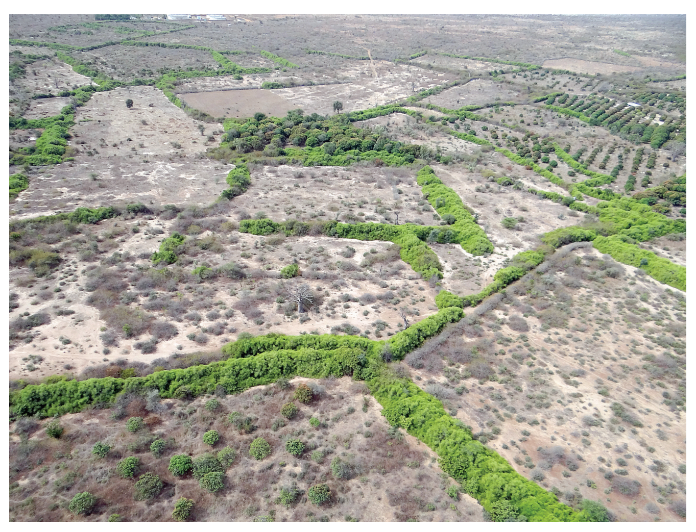
Figure 2. Habitat of tsetse flies (Glossina palpalis gambiensis) in the Niayes area of Senegal. Old Euphorbia edges provide the suitable microclimate necessary for the flies to circulate between patches of anthropic and natural tree habitats.

collectives (species and populations), setting aside the value of individual tsetse flies (but see, e.g., Taylor 1981, Vucetich and Nelson 2007, Wallach et al. 2018 for perspectives on obligations to individual living beings). Numerous types of value are attributed to species, including intrinsic and various instrumental values (discussed below), relational values (Chan et al. 2016), and transformative values (Norton 2014). We focus on the first two types, because they are relatively well established and widely endorsed within the conservation community (United Nations 1992, Trombulak et al. 2004).