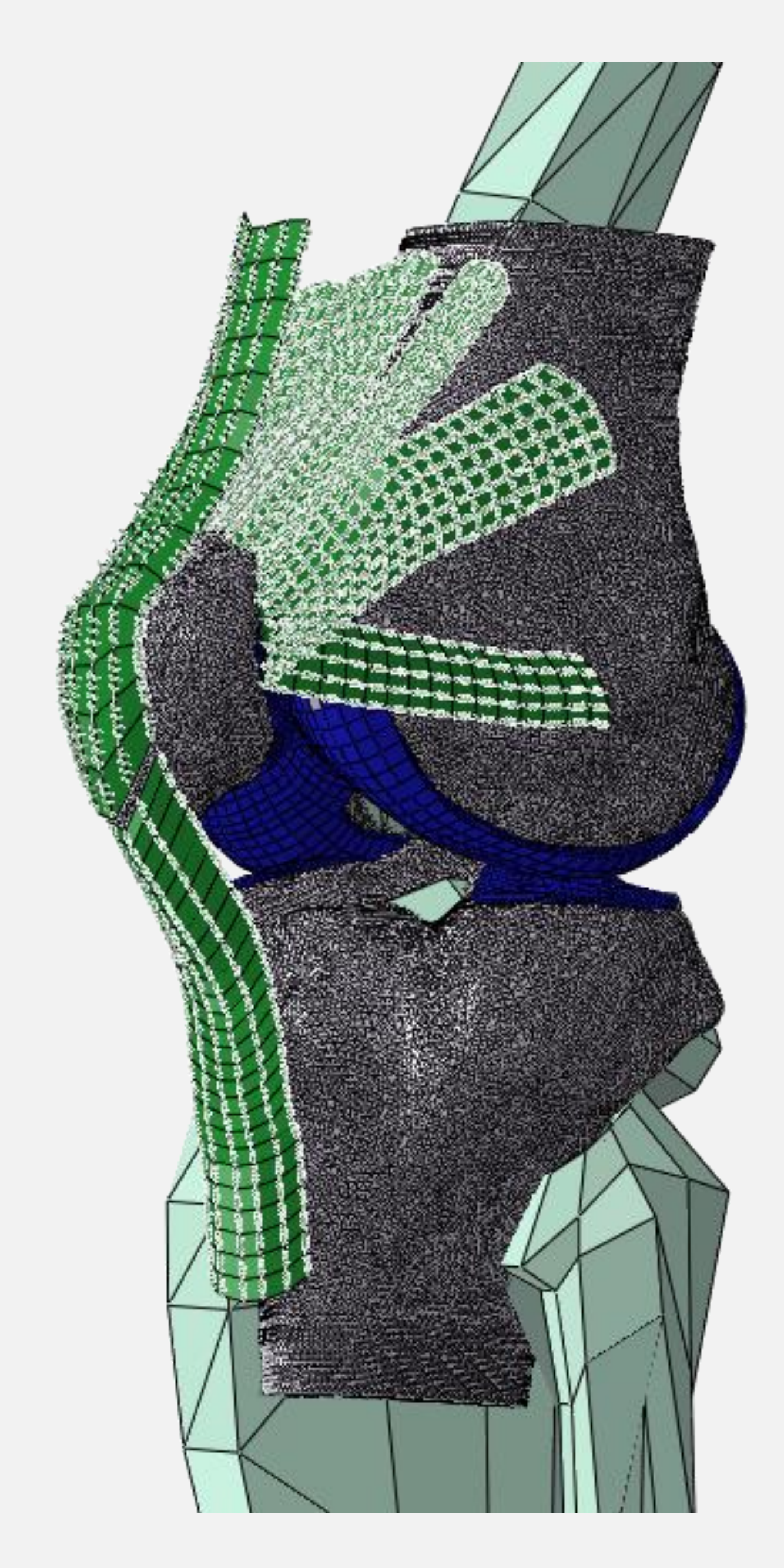
Figure 2: Detailed Knee Scaled and Fitted to Patient Specific Model with Surgery Specific Modifications

Kinematic data were obtained from 11 patients who underwent patellar advancement and/or distal femoral osteotomy procedures to correct for crouch gait. Pre- and postoperative gait analysis data were collected from these patients using a Vicon lower extremity marker-based motion capture system and in-ground force plates. Patient-specific muscle forces were predicted using the rigid-body musculoskeletal platform OpenSim [6].