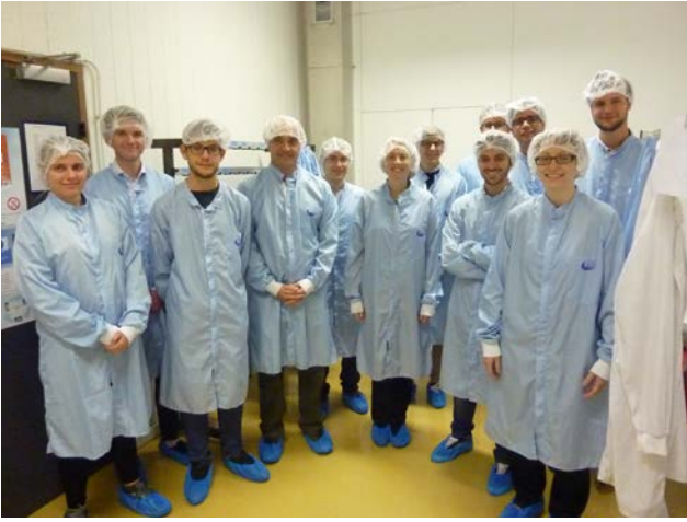
Fig. 3. Student and experts visiting the Centre Spatial de Liège (CSL) during the ESA/ELGRA Gravity-Related Research Summer School 2016