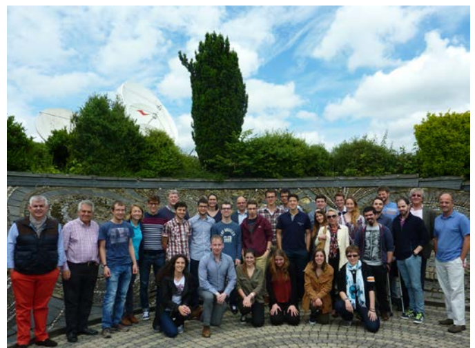
Fig. 1. Group picture at ESA/ELGRA Gravity-Related Research Summer School 2016

Each year, ELGRA contacts their members to offer them the opportunity to participate in the Summer School by submitting an abstract to propose a lecture in life or physical science. Three lectures in biology, human physiology and physics are selected. The selected ELGRA members join the Summer School for a minimum of one day and along with some additional ESA experts provide a background to their topic area, examples of gravity-related research and share their experience and expertise. Supporting the summer school is the student arm of the ELGRA association, SELGRA. SELGRA have created an active association for student members to communicate and share opportunities in gravity-related research, support conference attendance and communicate member activities. These experiences are shared at the Summer School and participating students offered the opportunity to join to provide further points of contact.