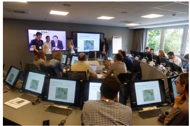
Fig. 2. Student group presenting their project to ESA and ELGRA experts during the ESA/ELGRA Gravity-Related Research Summer School 2017

Throughout the Summer School, the students are asked in groups of four or five to generate an idea for a future gravity-related experiment. During the time allocated for this group exercise, they are asked to come up with a scientific or engineering objective, to choose a gravity-related platform and propose a preliminary experimental setup and procedure. Students take advantage of the continuous presence of experts in the room to discuss their ideas. In the