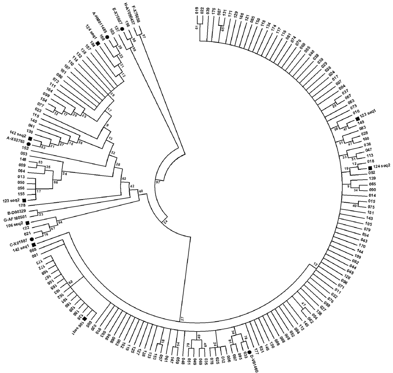
Figure 1. Phylogenetic analysis of Omani HBV strains. Phylogenetic analysis inferred from distance analysis (Kimura 2 parameters model) and neighbor-joining reconstruction from a partially overlapping region of P and S genes (from nt479 to nt766) of 170 Omani HBV DNA-positive isolates. The reference strains were denoted by HBV genotype and “●” signal with the GenBank accession number, respectively (for example: “A-HM011485●”). The Omani samples were numbered, and especially the double-infected samples were highlighted by the “■” signal. (The numbers at the nodes indicate bootstrapping values.) doi:10.1371/journal.pone.0097759.g001

aa positions 118–120, 125–128, 130, 133–135, and 143 were observed. Sixteen patients showed only one mutation, and three patients showed two and three mutations, respectively, in the “a” determinant region (Fig. 2 and Table 3).