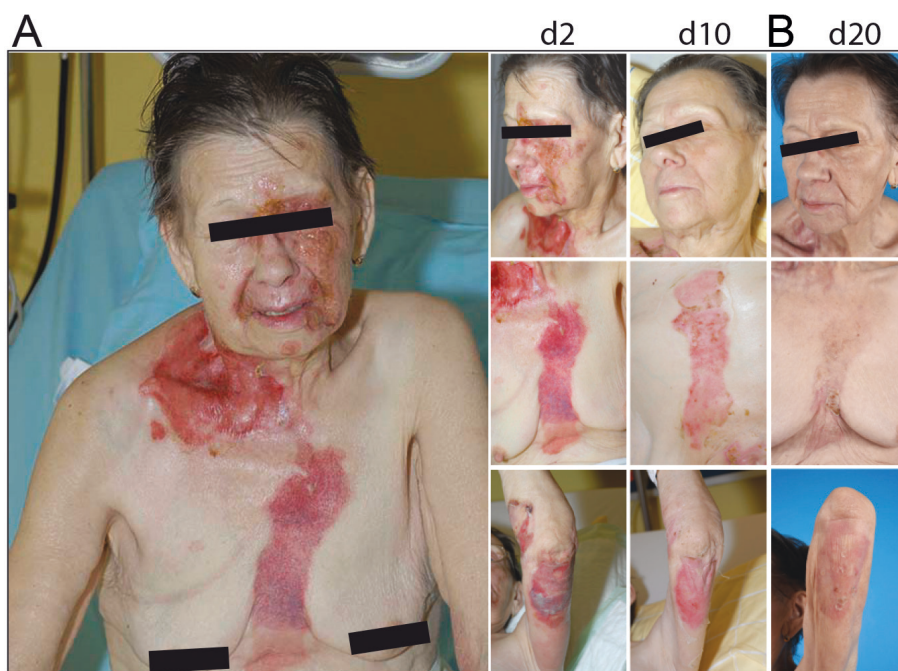
Fig. 1. Clinical course. (A) Flaccid bullae formation of face, neck, trunk and left arm. (B) Twenty days after initiation of antimicrobial therapy, lesions were healed without scarring. A written permission from the patient is given.

Perilesional histology of a fresh bulla showed a neutrophilic infiltrate in the upper dermis, spongiosis and acantholytic split formation in the stratum granulosum (Fig. 2A). A search for pemphigus antibodies yielded negative results. A gram stain of lesional skin revealed gram + cocci in the split (Fig 2B). Bacterial cultures from blood and sputum, as well as swabs of the nose and lesional skin, were positive for methicillin-sensitive S. aureus (MSSA). DNA sequencing of the S. aureus -specific staphylococcal protein A ( spa ) and multi-locus sequence-typing (MLST) revealed spa -type t729, sequence type (ST) 88 for all isolates. Strains were positive for the gene encoding the exfoliative toxin A ( eta ). A diagnosis of SSSS was made and the patient received intravenous piperacillin-sulbactam (4.5 g i.v. 3 times daily for 10 days) until complete remission (Fig. 1B).