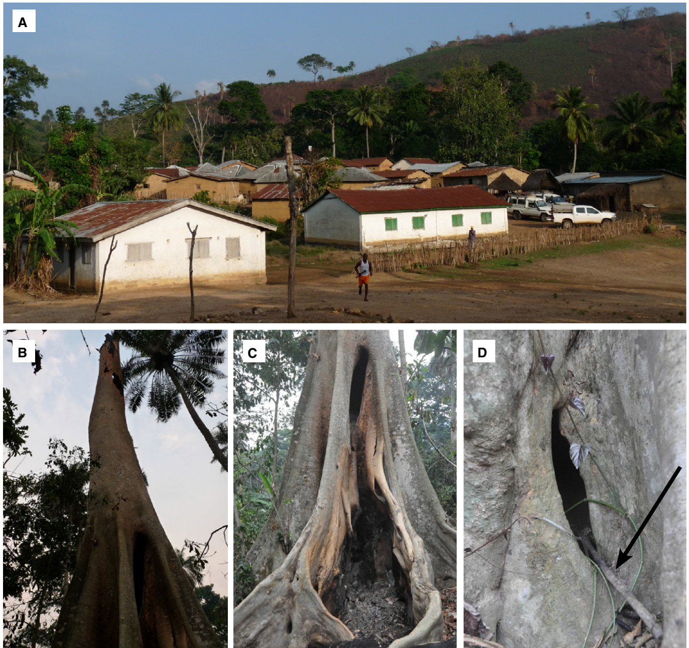
Figure 3. Meliandou and the burnt tree that housed a bat colony.