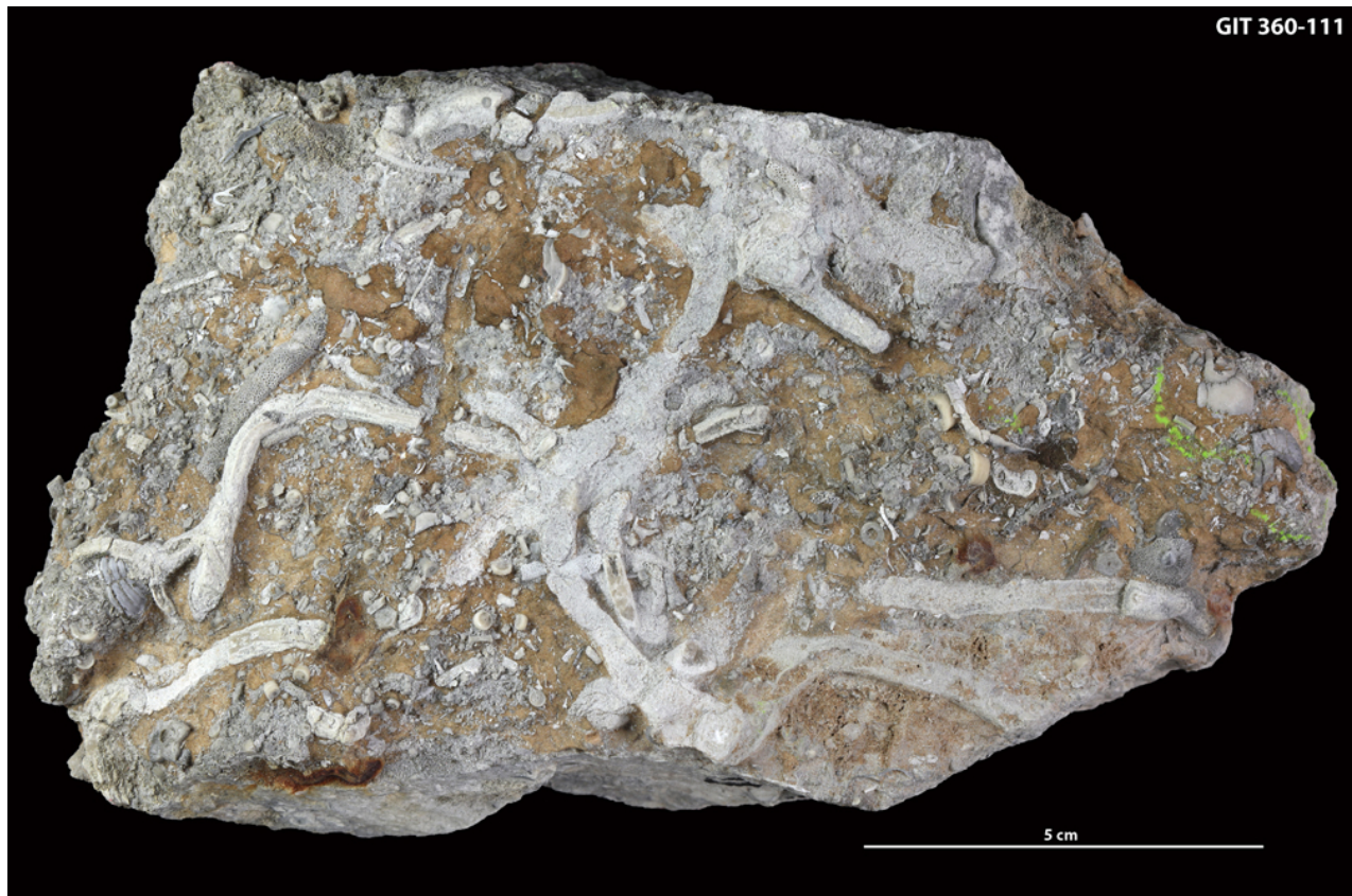
Figure 3: Horizontal view of T. patens from the Kukruse Regional Stage (Sandbian), northeastern Estonia (GIT 360-111).

noted that Teichichnus behavior type is not beneficial in areas of slow and steady sedimentation rate; Estonian material originated from such areas of shallow epeiric sea and is in agreement with this idea. Findings of Teichichnus burrows are related with deeper environments than shoreface and also with periods of higher sedimentation rate in the Ordovician and Silurian. Teichichnus burrows have mostly been reported from siliciclastic rocks (SEILACHER, 1955; BUCKMAN, 1996; SEILACHER, 2007; SCHLIRF & BROMLEY, 2007; KNAUST, 2018). Fewer findings are reported from carbonates, mostly from Mesozoic chalk (e.g., FREY, 1970; FREY & BROMLEY, 1985). There are important differences between the formations of trace fossils in carbonate versus siliciclastic sediments (CURRAN, 1994; KNAUST et al. , 2012). In carbonate rocks it is common that colour contrast is absent, which impacts the preservation of trace fossils (CURRAN, 1994). This may explain the more frequent occurrence of Teichichnus in kukersite bearing beds in lower Sandbian of Estonia where clear color contrast occurs between the trace filling and rock matrix.