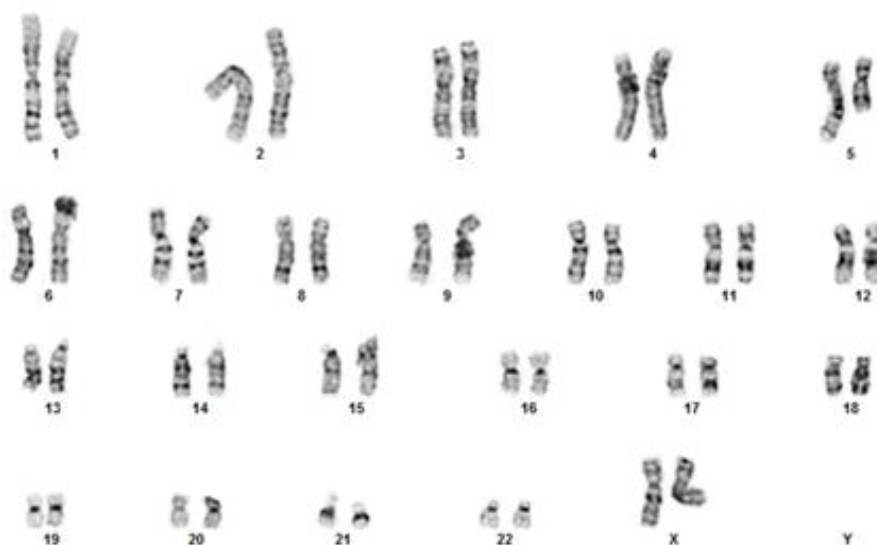
Figure 2: The karyotype in a case of MDS with isolated del(5q) showing 46,XX,del(5)(q22q35).