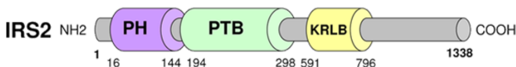
Figure 1. Schematic structure of IRS2. The pleckstrin homology (PH) domain (purple), phosphotyrosine binding (PTB) domain (green) and kinase regulatory loop binding domain (KRLB) are illustrated in the Figure. Amino acid (aa) positions are indicated.

IRS2 belongs to the insulin receptor substrate (IRS) protein family, which is characterized by the presence of a pleckstrin homology (PH) domain and a phosphotyrosine binding (PTB) domain (Figure 1) in their protein structure. The PH domain contributes to protein-protein binding and facilitates the recruitment of IRS proteins by cell membrane receptors.