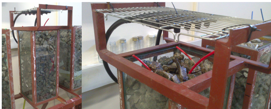
Figure 1. Scheme of the laboratory experiment and the rainfall simulation device.

A standard HFD design composed of Type B aggregate ( BSI, 2006 ) was simulated in the laboratory. Four replicates of this design were used for statistical replication, helping in the comparison with the design tools. The rigs used in this experiment were composed of plate-glass and their dimensions were 21.5 cm x 21.5 cm x 65.0 cm for a total volume of material of 0.030 m 3 . No bottom pipe was used in these models in order to get the infiltration rates of the Type B material and avoid the limitations given by the pipe, allowing a more accurate comparison with the outputs obtained by using the software from design tools.