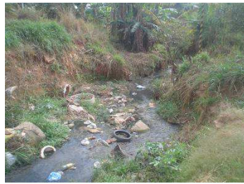
a) Wastewater and solid waste