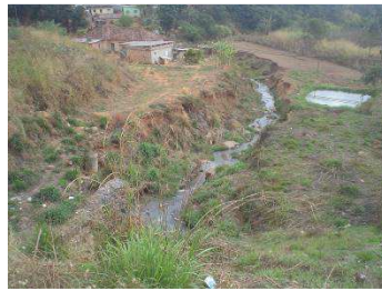
b) Eroded bank