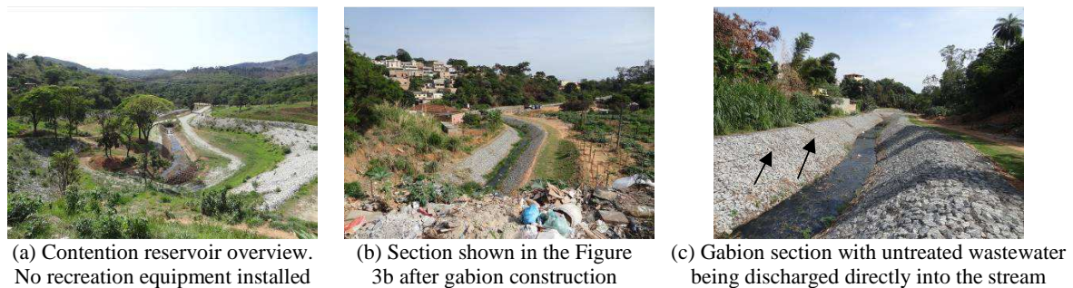
Figure 4: – Bonsucesso Creek after the intervention

The water quality monitoring report of the program of March 2012 (Belo Horizonte, 2012), which evaluated the basin water from April 2008 to February 2012, i.e., before and after the intervention works, confirmed that the water contamination by wastewater was not solved according to the qualitative field evaluation. Three monitoring points was chosen, i.e., Olhos D'água Creek (E 1 ) and Bonsucesso Creek (E 2 , E 3 and E 4 ). BOD (Biochemical Oxygen Demand) values at the four monitoring points were all the time above the value required by the local law, which's up to 5mg/l, except in two of the evaluations at E 1 . The mg/l values of the samples collected in February 2012 were E 1 = 3.3, E 2 = 64.2, E 3 = 26 and E 4 = 21.1. The Water Quality Index (WQI) evaluated the quality according to the following rating: excellent, good, average, bad, and very bad. Except Olhos D'água Creek, E 1 , which's mostly in a preserved green area, the water quality remained the same or declined at all the other points, and was categorized as bad or very bad.