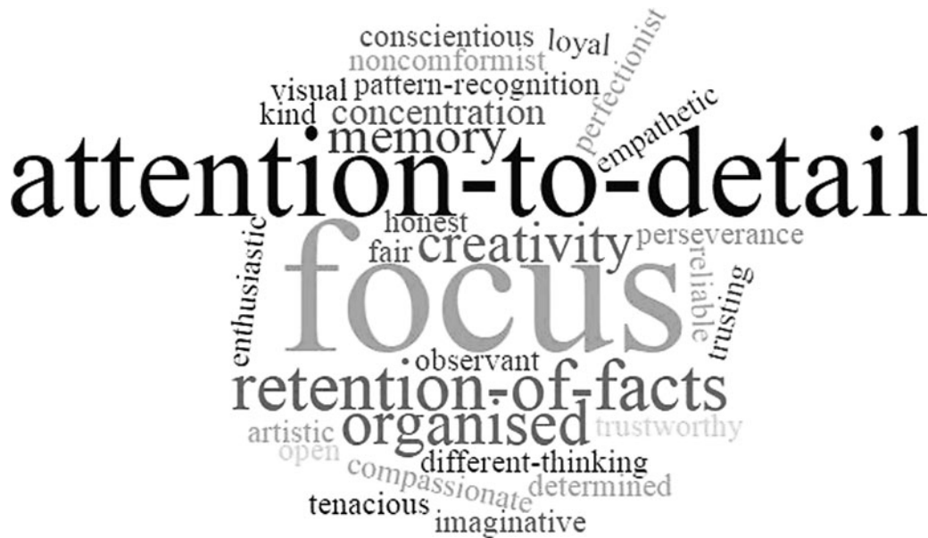
FIG. 1. Word cloud showing advantageous traits as described by participants.