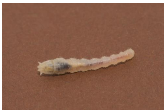
FIG. 1. Dorsal view of a late instar larva of Vermileo vermileo.

Newly-hatched wormlion larvae have an average length of 2.5 mm (Hafez and El-Moursy 1956a), while for mature ones their length can reach over 12–14 mm prior pupation (Fig. 1). The colour of the larvae is light yellowish, their body is translucent, and the alimentary canal and its content is clearly visible and recognisable. The eighth abdominal segment terminates in four conical fleshy lobes. The building of pitfall trap is performed by the head, while in the case of antlions the terminal setae of the abdomen has also an important digging role. Total developmental period of larvae is extremely long (3 to 4 years) during which several larval instars are included. The duration of the larval stage is largely influenced by the quality and quantity of nutrients, as well as by climatic conditions (Séméria 2006). Development of the wormlion pupae lasts 9–10 days, depending on temperature (Le Fauchaux 1961).