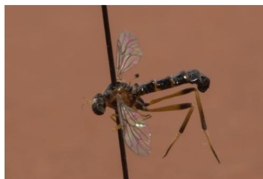
FIG. 2. Lateral view of a female adult, Vermileo vermileo.

be seen. On the mesonotum, three longitudinal blackish-brownish stripes are characteristic. The abdomen of the male is slenderer than that of the female (Nagatomi and Iwata 1976), and bulkier at the end. The pedicel of the halteres is yellow, while its clubby capitulum is dark brown. The wings are vitreous and strongly iridescent (Séguy 1926). The males are generally smaller and slenderer than females; their body length is 6–7 mm, while that of the females is 7–9 mm. The wing expanse at males is usually 9.8–10.7 mm, while in the case of females is 9.8–14 mm (Hafez and El-Moursy 1956b). Under laboratory conditions, emergence occurs around 9–11 am (Hafez and El-Moursy 1956b). The adults have short life span, primarily restricted to reproduction.