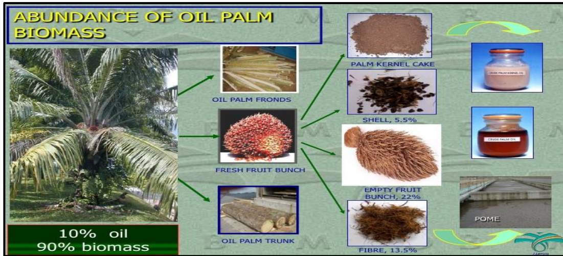
Figure 2. 2: Product and waste distribution from oil palm tree.