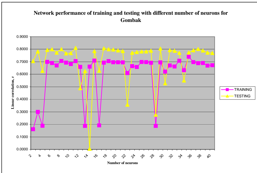
FIGURE 3 Network performance of training and testing with different number of neurons for Gombak

From table 2, the value of MAPE shows that Neural Network can forecast demand on low cost housing in Petaling very good with MAPE of 6.42 and 4.32.