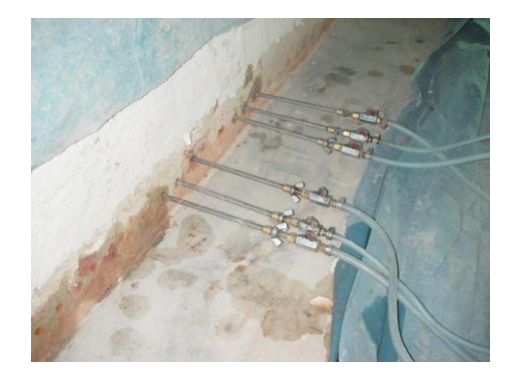
Figure 3. Treatment of a Course of Damp-proofing Through Chemical Injection