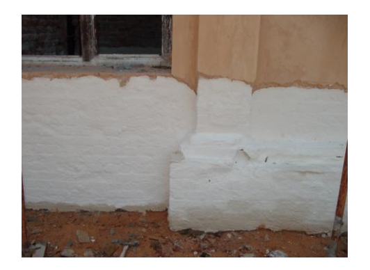
Figure 2. Treatment of Salt Desalination on Wall Surfaces Through the Process of Poulticing

The injection of a chemical damp-proof course is the cheapest and easiest way to provide barrier in masonry walls to prevent rising damp. The treatment has to be applied prior to the treatment of salt attack. Chemical injection is carried out by drilling into both sides of the affected walls. The drilling is usually carried out at intervals along the wall at about 6 inches from the floor to a particular depth (depending on wall thickness). A silicone-based chemical is then injected either by using gravity flow or pumps until it is saturated and forms a moisture barrier that later prevents any water or dampness from moving upward in the masonry walls.