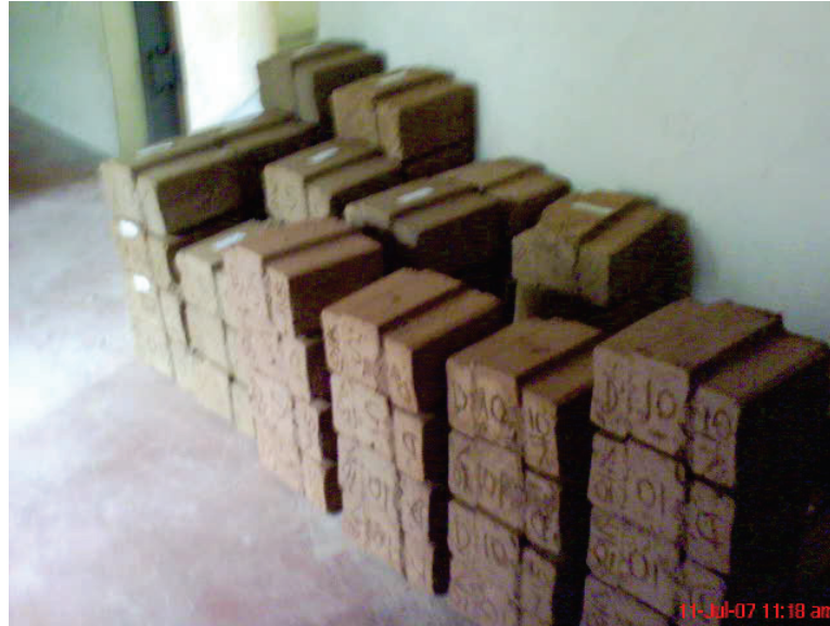
Figure 2. Stacking of Lateritic Interlocking Blocks

The blocks were first allowed to air dry for 24 hours under a shade constructed from a polythene sheet. Thereafter, water was sprinkled on the blocks in the morning and evening, and the blocks were covered with a polythene sheet for one week to continue the curing process and prevent rapid drying of the blocks, which could lead to shrinkage cracking. The blocks were later stacked in rows and columns with a maximum of five blocks in a column until they were ready for strength and durability tests (see Figure 2).