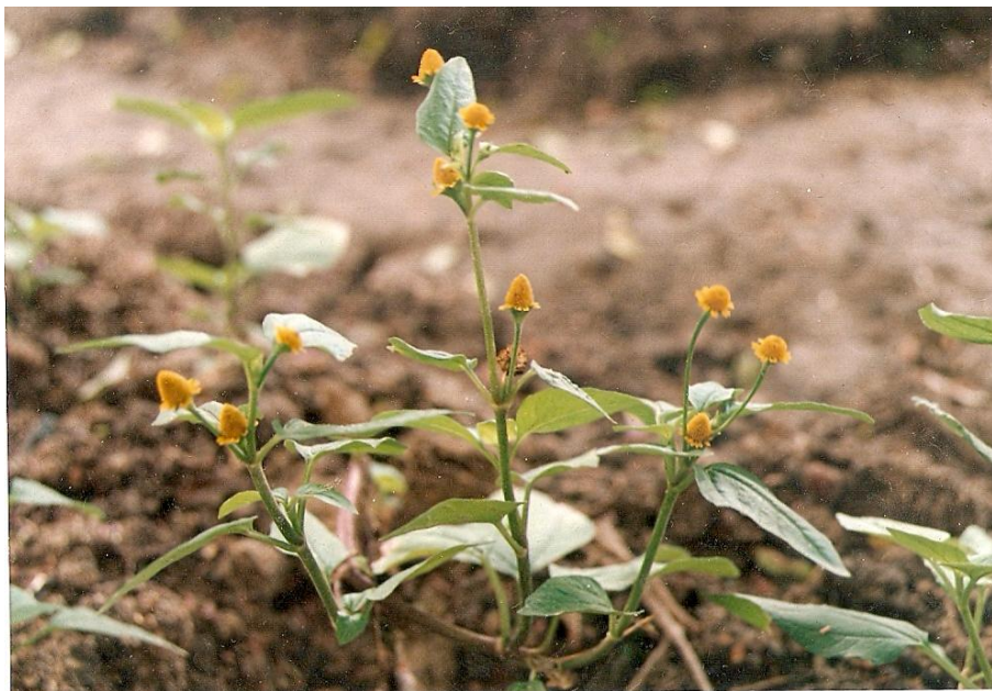
Figure 2.1 Spilanthes acmella L.

form tight cones. Inflorescences of S. acmella are solitary, located at the terminal and axillary pedunculate capitula (Hind and Biggs, 2003). Tan (2004) noted that roots are often seen at lower nodes. This plant can be propagated either by seeds or stem cuttings (Chandra et al. , 2007).