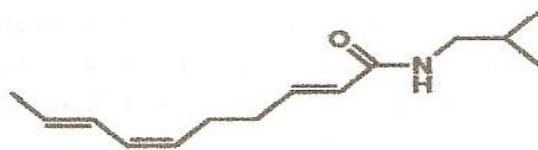
Figure 2.3 Affinin (Molina-Torres et al. , 1999)

Besides spilanthol, new amides, 2-methyl-butylamide, ( Z )-non-2-en-6, 8-diynoic acid isobutylamide and ( Z )-dec-2-en-6, 8-diynoic acid isobutylamide were isolated from S. oleracea (Greger et al. , 1985). Nakatani and Hagashima (1992) determined three alkamides, ( 2E )- N -(2-methylbutyl)-2-undecene-8, 10-diynamide, ( 2E , 7Z )- N -isobuthyl-2, 7-tridecadiene-10, 12-diynamide and ( 7Z )- N -isobuthyl-7-tridecene-10, 12-diynamide from S. acmella L. var. olearacea Clarke. Both studies also reported that spilanthol was identical with affinin (Figure 2.3). Molina-Torres et al. (1999) noted that the roots of Heliopsis longipes contained the affinin.