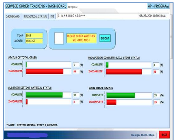
Fig. 1: Operational Dashboard

From the interview sessions conducted with the staffs from the operation section of the Manufacturing firm, their feedback was obtained. Their feedback was gathered on the amount of time saved by using the dashboard as compared to the previous manual method they were using. The type of data they were analysing is the orders data for one month period. Brief details of the interview session and the summary of their feedback are tabulated in Table 2 and Table 3, respectively.