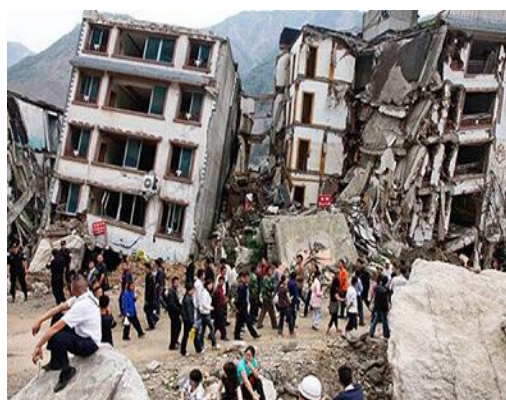
Nepal earthquake (2015)