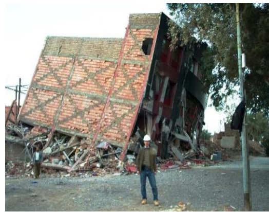
Iran earthquake (Bam 2003)