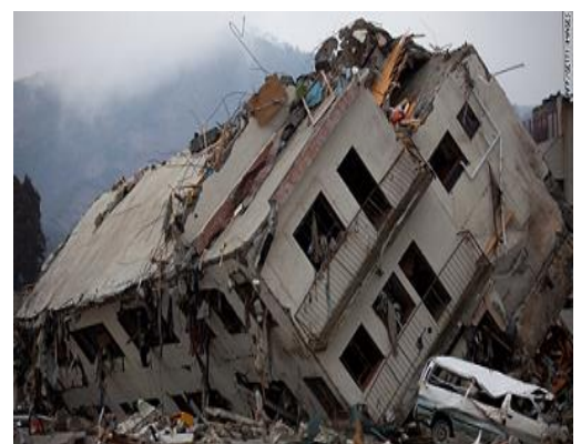
Japan earthquake (2011)