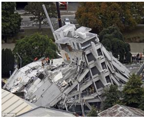
New Zealand earthquake (2011)

ductility. Figure 1.1 shows some of the structural failure around the world due to earthquake. Widespread damage from the 1929 Murchison and 1931 Hawke's Bay earthquakes had a profound effect on public perceptions of the hazard posed by earthquakes. Attention was focused on weaknesses in building construction, especially poor building standards and lack of any provision for earthquake-resistant design. This led to formulation of seismic design guidelines which was incorporated into the building codes. The current building codes (i.e., ASCE, Eurocode 8) recommend that earthquake loading must be considered in design in addition to the gravity load for constructing a structure in a seismically active zone. In addition, the buildings constructed prior the current seismic design codes also require retrofitting or upgrading to be protected from earthquakes.