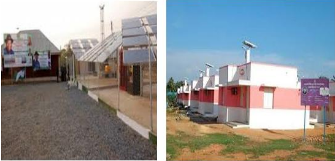
Figure 1.1 Installed solar power system at Idda village, Kogi state [12].