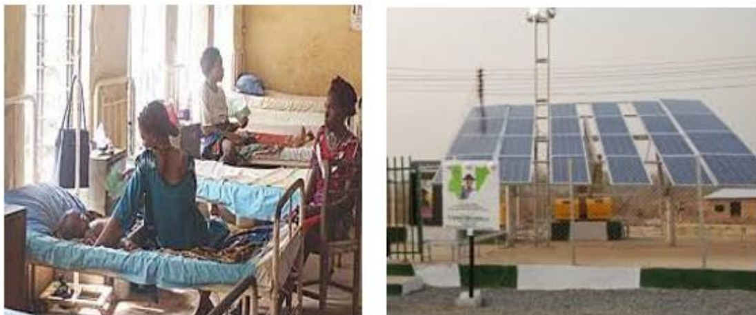
Figure 1.2 Installed solar power system at kwoi village, Benue state [12].