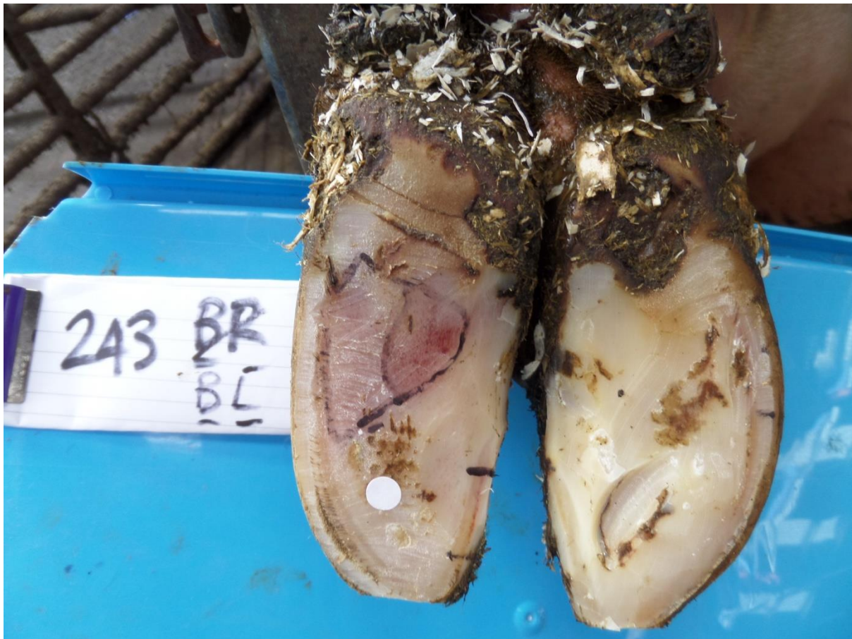
Fig 1: Example photograph of a foot after trimming and examination to be further analysed using Image J software.

of the sole and the length of the white line was measured for each claw. The area of the sole was calculated as the area within the perimeter of the white line, cranial to a curved line drawn between the estimated positions of the axial and abaxial grooves, which marked the junction of the heel bulb (Leach and others, 1998). The area of all haemorrhagic lesions of the sole and the length of all haemorrhagic lesions of the white line were measured, in mm 2 and mm respectively.