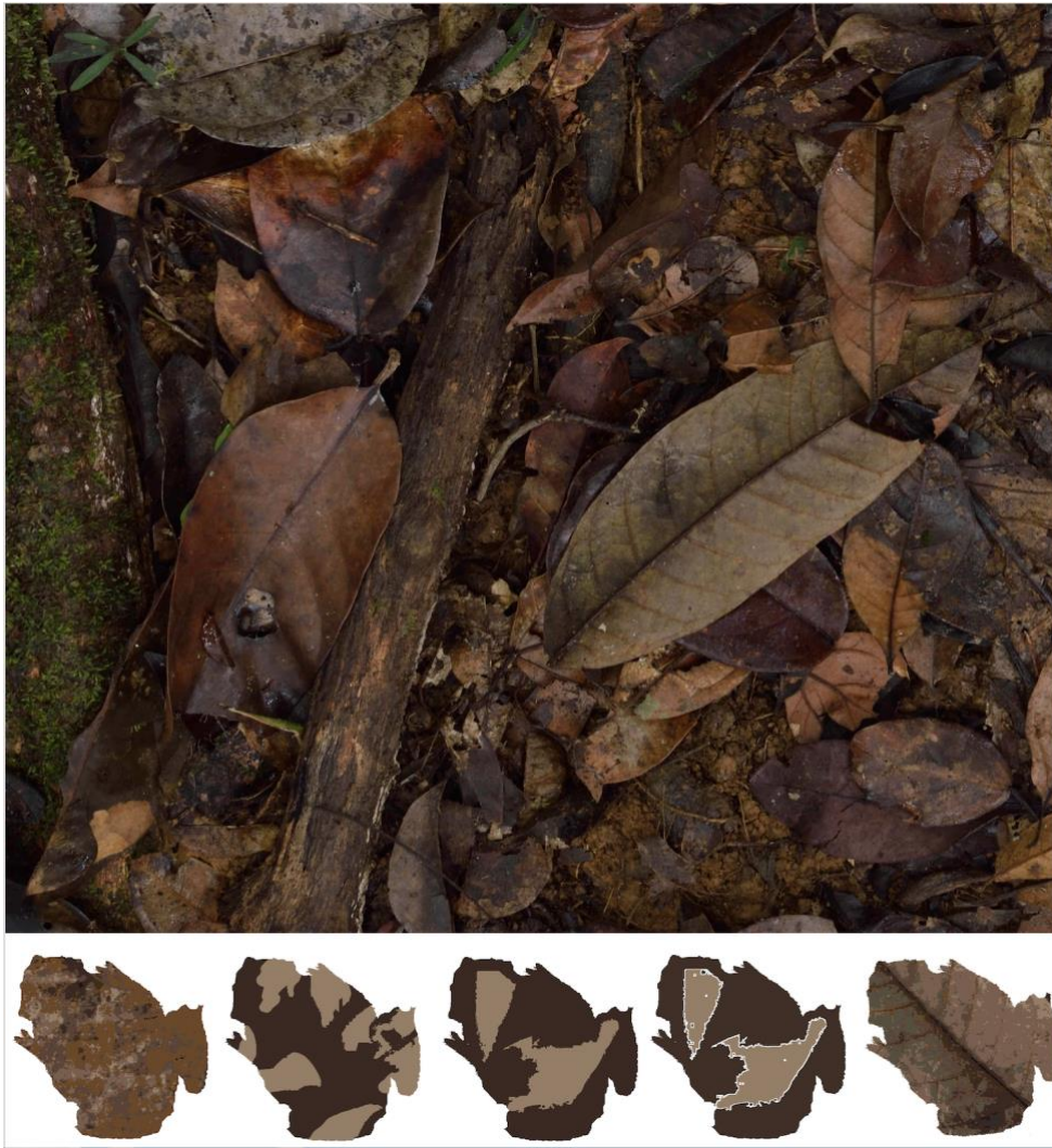
Figure 2. Different camouflage strategies that a frog might employ for a forest-floor background. Left to right: background matching (a frog-shaped sample of the background), edge disruption (high contrast patches breaking up the body's edge), surface disruption (breaking up the body's surface with high contrast patches that are perceived as distinct objects, so not part of a recognisable animal), surface disruption with edge enhancement (edge disruption with edge enhancement is also possible), and masquerade (mimicry of a leaf). Forest floor photo from French Guiana, © C. Michalis 2014.