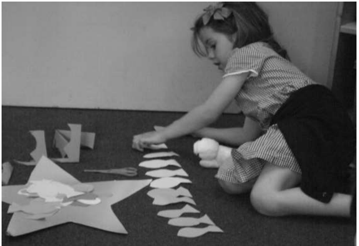
Child telling 'Penguin'