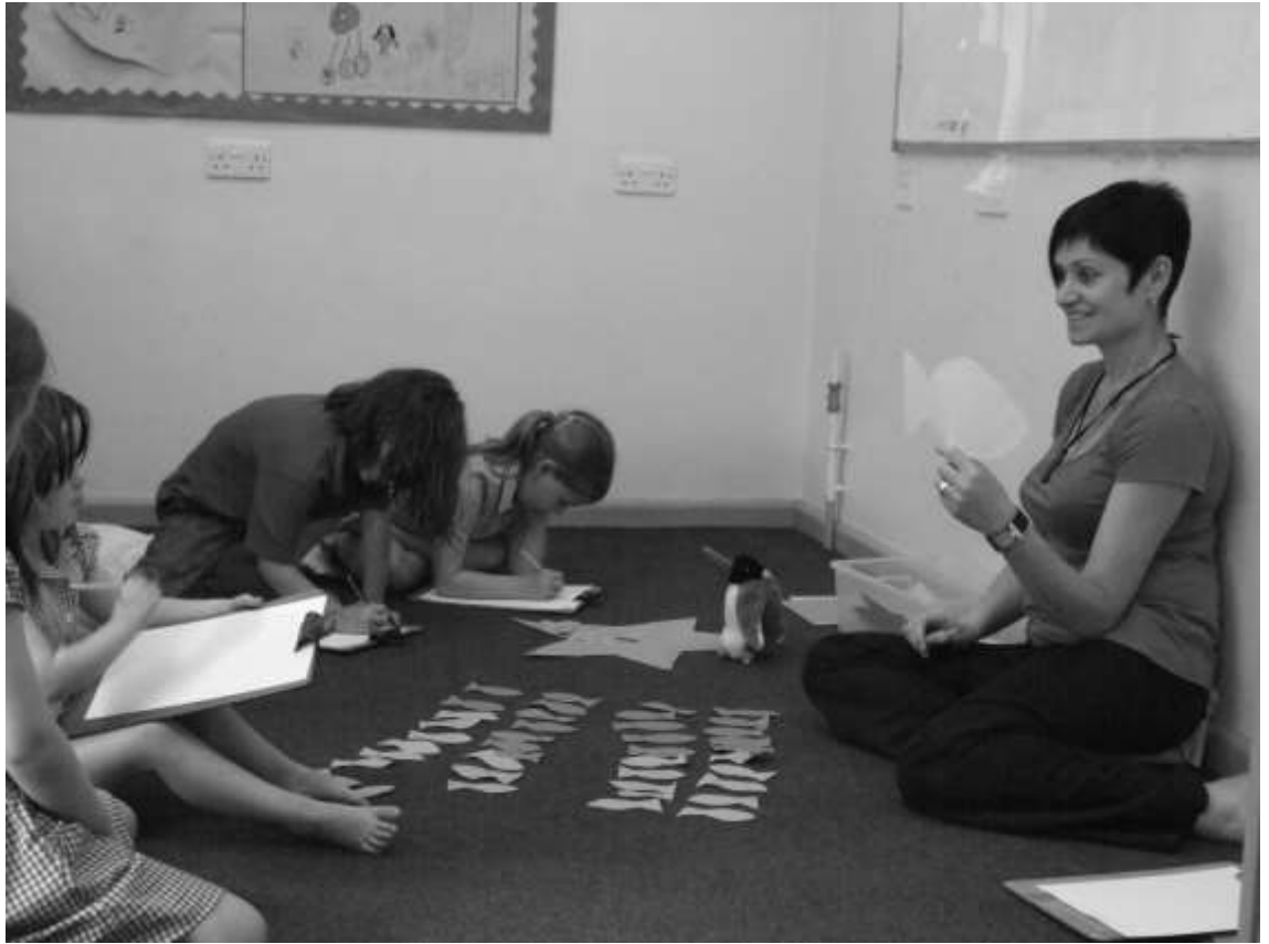
Teacher sharing 'Penguin' with reception group of children