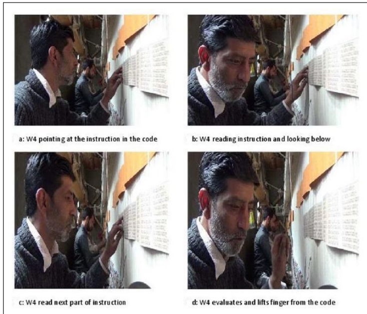
Figure 2. Evaluation being done by W4

(Goodwin & Goodwin, 1996) informed by the task relevancy in the local environment suffused with tools and equipment. In these warp threads, the main page of the talim is inserted first, followed by sequential insertion of its auxiliary parts . This arrangement establishes a linear order of processing on rolls and puts them in shared access of other weavers. On my primary observational loom in the karkhana , while the main page and a small portion of part-1 fixed in the corner is read aloud by weaver-1 (W1) which is listened and followed by weaver-4, its part-2 and 3 fixed in the middle is read aloud by weaver-2 (W2) sitting beside W1 and is followed by weaver-3 in the middle. The roll placement on the loom accords with the weavers' seating arrangement and distributes the cognitive task of information extraction among both reader-weavers, i.e., W1 and W2 equally.