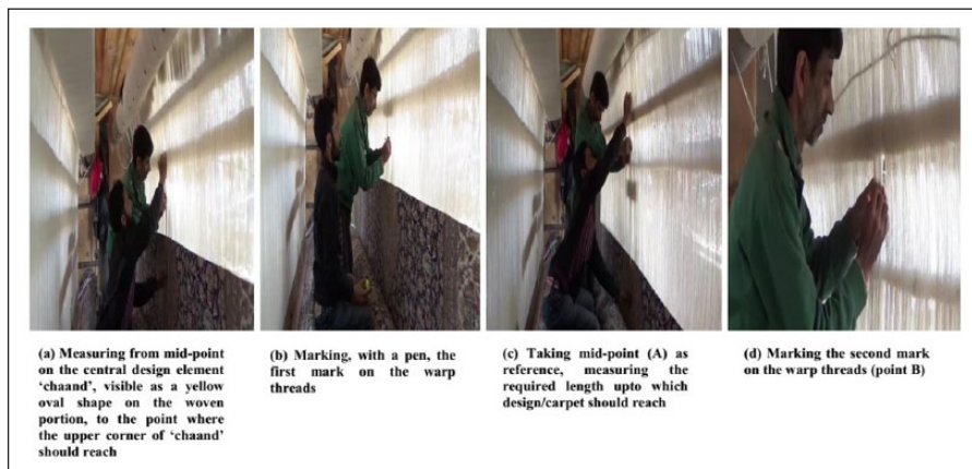
Figure 3. Measurement being done on the loom.

exhaustion of rolls in the set, but checks the progress of height on the loom. For instance, if one talim roll guides weaving activity of one-inch and there are 30 remaining rolls in the set, i.e., for guiding weaving of 30 inches or two-and-a-half feet, but the weavers' evaluation shows the required height of three feet till point B, then a discrepancy of half an inch, due to the thumping action, occurs. The remaining 30 rolls can only guide the weaving of two-and-a-half feet, but in order to complete the required 12 feet, three feet must be woven. This is the gap which the weavers now must fill.