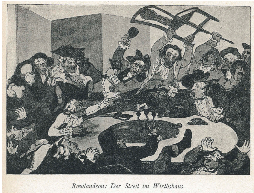
Figure 1. Thomas Rowlandson, Der Streit im Wirtshaus ( Fight in an Ale House a.k.a. A Kick-up at a Hazard Table ) (March 1790) illustrated in Richard Muther, Geschichte der Malerei im XIX. Jahrhundert (1893), 2:15; private collection.

image was surely not xenophobic. Even so, it may perhaps partly have been his fear that English-language readers would accidentally impute a slight (that all Britons were alcoholic gambling thugs) that led Muther to supplement the illustrations for the 1893 translation. Rowlandson's A Fight in an Ale House was thus joined by Gillray's Affability (Figure 2) and Rowlandson's Harmony (1790), inserted as whole-page illustrations between the extant text on pages 19 and 25 respectively. Again neither work was referred to in the letterpress.