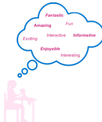
Figure 5: Participants one word summaries of the workshop (responses to question one on the Post-Workshop Questionnaire)

As highlighted, the participants all identified a prior interest in dressmaking, and were keen to begin the workshop. However, it was apparent that they wanted to achieve the end result straight away. This became obvious through a reluctance to fully read and understand the instructions. Rather than rely on problem solving skills, participants requested to be directly told or shown what to do. This desire to be immediately satisfied was reminiscent of literature exploring factors that have contributed to individuals expecting such immediate solutions [31] . However, once participants began to take ownership, the distractions disappeared, as seeing their work evolve encouraged them to continue, indicating positive reinforcement. One individual who had made significant progress by the end of the workshop exclaimed: “I just want to stay all night and finish it”. Informal questions and empirical observations during the class further enforced the importance of fashion to the individual and the connotation relating to perceived social identity. At the same time, awareness of sustainability issues and the underlying concerns were commonplace amongst the participants. Their knowledge of these issues was mostly conveyed through education and exposure to conventional media.