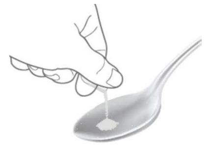
Give complete dose (2.5mg) to child following administration instructions