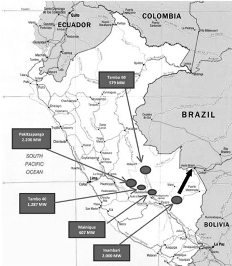
Figure 1 Location of Dams Proposed by Treaty.

Source: First author's adapted map from CAH documents.