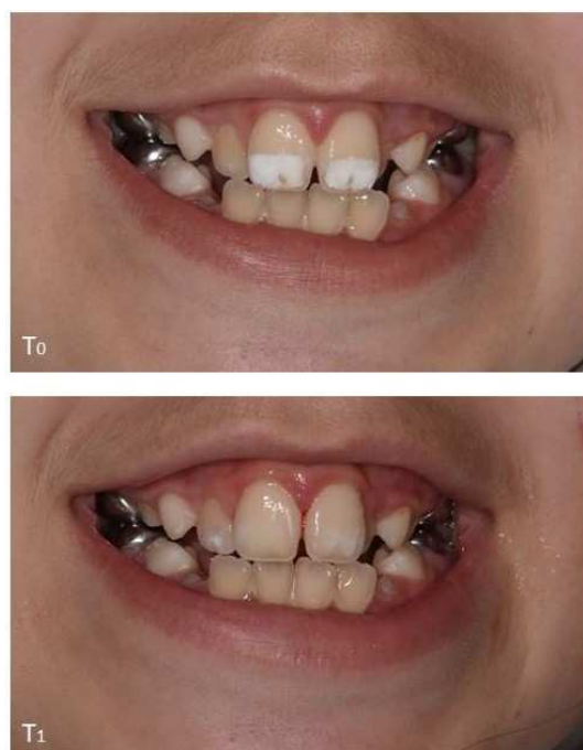
Figure 1. Clinical images to show the appearance of a 'typical' participant's permanent central maxillary incisors before ( T_0 ) and one-month after ( T_1 ) treatment (microabrasion followed by resin infiltration).

Standard clinical photographs were acquired of children's anterior teeth before any treatment at baseline ( T_0 ) and at one-month review ( T_1 ) using a digital SLR camera (Nikon D3400, Nikon UK Ltd., Kingston upon Thames, UK) equipped with a Sigma EM 140DG macro ring flash (Sigma Imaging (UK) Ltd., Welwyn Garden City, UK) and Tamron 90 mm macro lens (TAMRON Europe GmbH, Berkshire, UK). These clinical images were taken at standardised settings (ISO 100, 1/160 speed and F/22 aperture), distance (about 20 cm between operator and the patient), and natural and room illumination conditions. Some examples of these are shown in Figure 1. Images were stored electronically as part of the patients' dental records.