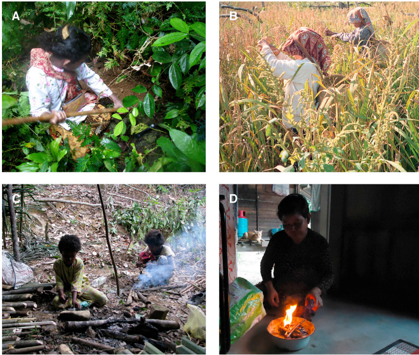
Figure 1. Semaq Beri and Semelai Going about Their Daily Lives

(A–D) (A) Semaq Beri woman foraging for yams, and (C) children making a new fire to avoid mixing cooking odors; (B) Semelai women harvesting rice, and (D) burning fragrant incense to quell a storm.