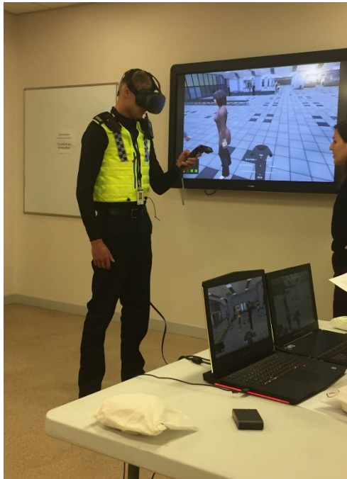
Figure 2- VR Training with AUGGMED

Each group was assigned their own assessor, with the assessor adopting the role of an employee in the scenario. They could disseminate additional information to the participants, if they were asked. This information was provided on an information sheet. If the information was not available, assessors would reply with "I'm not sure about that." The assessor was also responsible for providing a debrief to their group after training to ensure that any mistakes that were made during the training were identified and rectified.