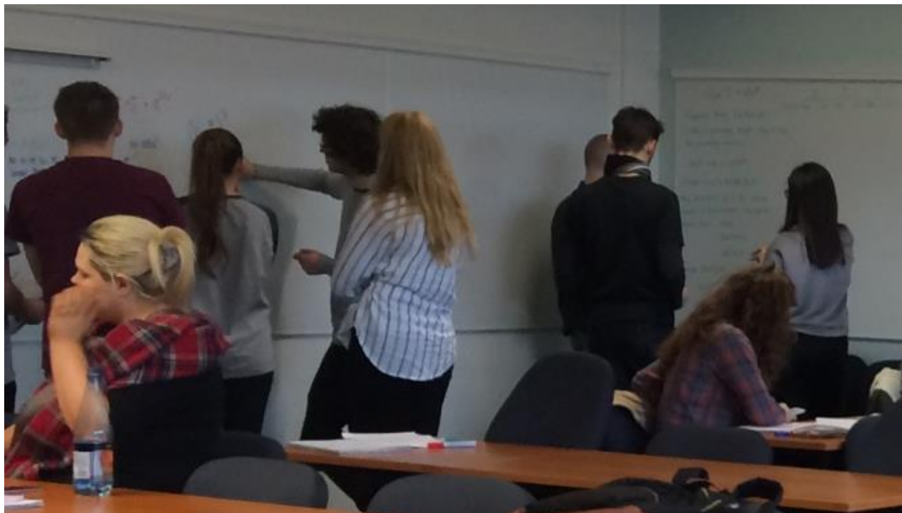
Figure 2: Students working at large whiteboards during a 'board tutorial'.

In Modules 2C and 3D, large whiteboards are used within revision sessions, which happen in the final three weeks at the end of year. This method is preferred to a tutor-led approach in order for the students to construct their own understanding and for the tutor to provide help where it is most needed. The students are split into groups and asked to work on questions from past papers.