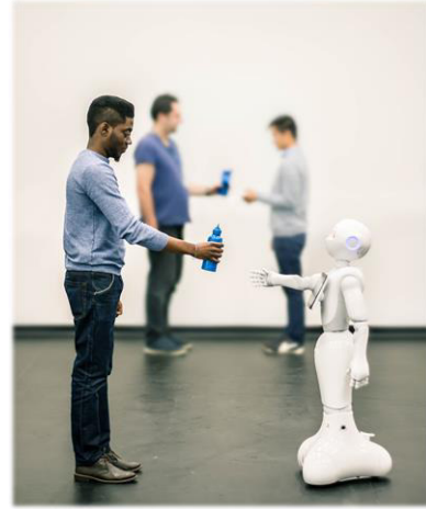
Figure 1. An illustration of Transfer Learning with an Assistive Robot.

In the case where F_S = F_T there can be a direct mapping from source to target to achieve transfer. This case is a much simpler case of TL where the challenges of what/when to transfer can be addressed with less computational effort. However, for example in applications such as human-robot interaction where a robot is required to learn an action from a human, this can be activities like pick and place objects in assisted living environments. The human and robot are considered as the source and target domains respectively. The differences in both feature spaces makes it not feasible for a direct mapping of features across the robot/human domains. This work assumes the robot domain needed for transfer of knowledge differs in feature space from that of a human, that is, F_S \neq F_T and therefore for TL across such domains we